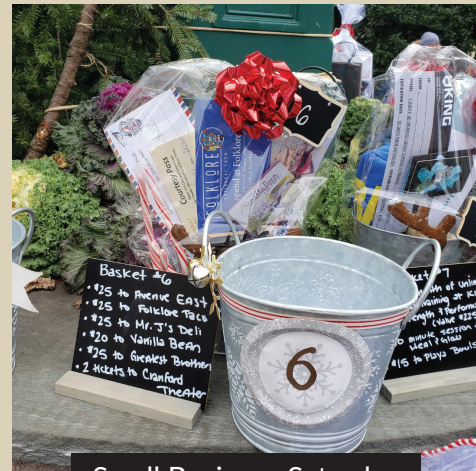
Small Business Saturday

Recognition in our email marketing to more than 5k subscribers