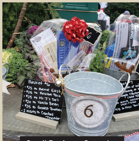
Small Business Saturday

Recognition in our email marketing to more than 5k subscribers